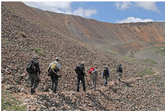
Hi ho, hi ho, we're off to dig in Colorado....