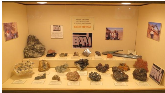
BAM "Heavy Metal" case.

This year's theme was "Heavy Metals", one that apparently caused a little grumbling amongst the lapidary crowd. It certainly inspired some excellent display cases of minerals, however; there were a greater number of mineral displays than in recent years and with some great rocks.