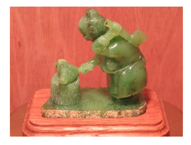
"Chicken Dinner" jade carving from the Dale Blankenship case.

The show's theme was "Jade", a favorite of Californian lapidarists, and included a special section of cases on jade and jade carvings. Also on display was the club's famous Jade Clock, a full-sized grandfather clock built in 1959 almost entirely out of jade.