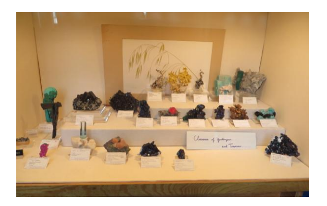
Jack Halpern's case – always drool-worthy!