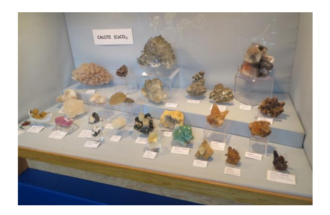
Jean Lee's calcite display