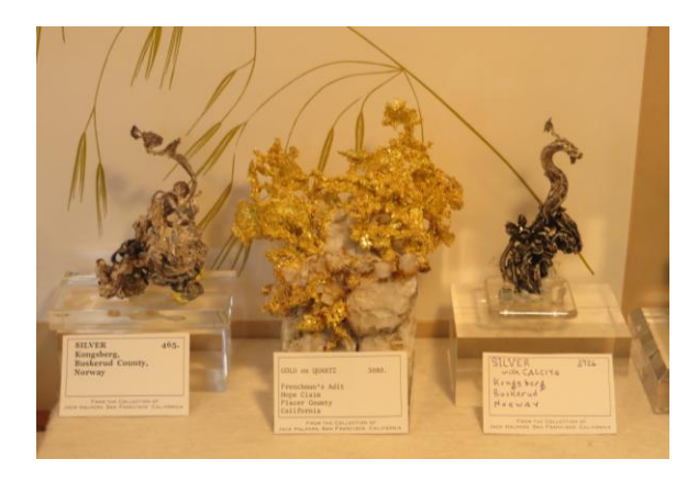
When one Kongsberg silver just isn't enough... detail on J. Halpern case.