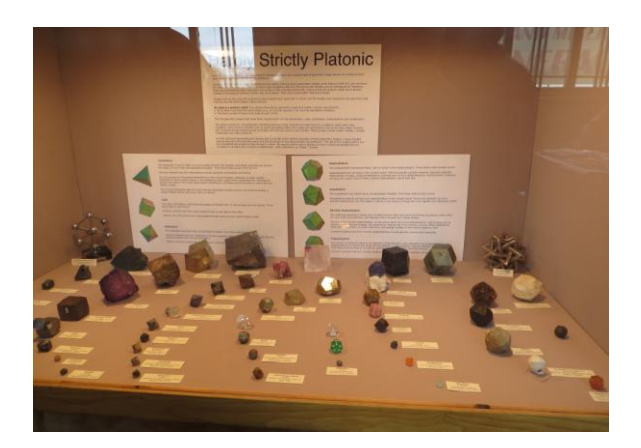
Dan Carlson's display of Platonic solids.