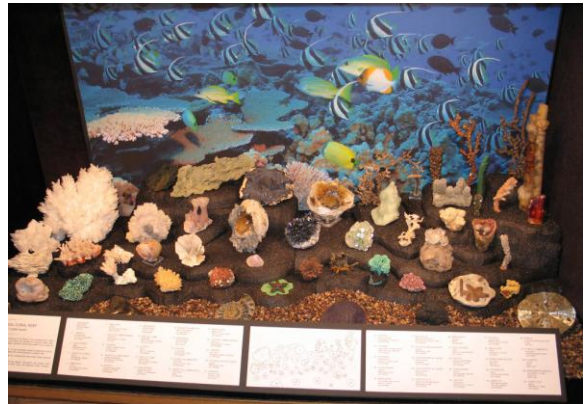
SF Crystal Gazers mineralogical coral reef