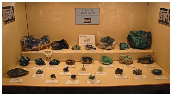
BAM display case.