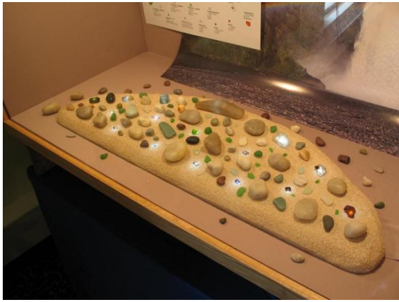
Dan Carlson's display with stream-worn gemstones illuminated

in one, with contributions from several 'joint' members.