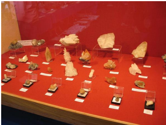
Barb Matz's collection of American calcites