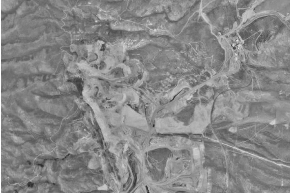
Satellite and Topographic views on the same scale of the Getchell Mine