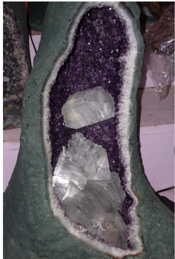
Selenite in amethyst. Not your average carry-on rock for the flight home.

"This I found in a garimpeiro's garage in Ametista do Sul, Rio Grande, Brazil, this summer. The opening is about 2 feet. Not exactly a personal dig, so ... but then over there it's hard."