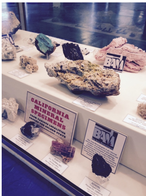
A partial view of BAM's large, awesome display at the Santa Clara show, April 18-19.

The symposium is held at the El Dorado Community Hall, west of Placerville and only a short drive from the Bay Area. The registration fee is $20 in advance, $25 at the door. Bring a microscope and light, and any materials you care to share on the giveaway table. Following the symposium, Stan Bogosian will lead a field trip to Clear Creek Management Area.