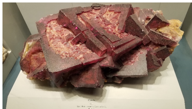
Crazy big fluorite group, Cave In Rock IL