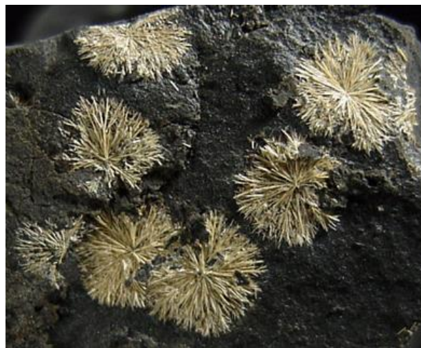
Ferristrunzite from Blaton, Henegouwen, Belgium (type locality)

If you have Belgian minerals in your collection, this would be the perfect time to show them off!