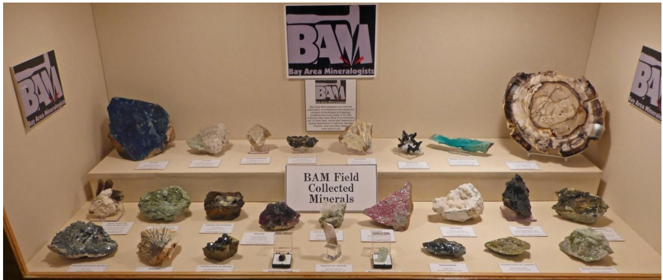
The BAM club case. Many thanks to all who contributed specimens and/or finesse!