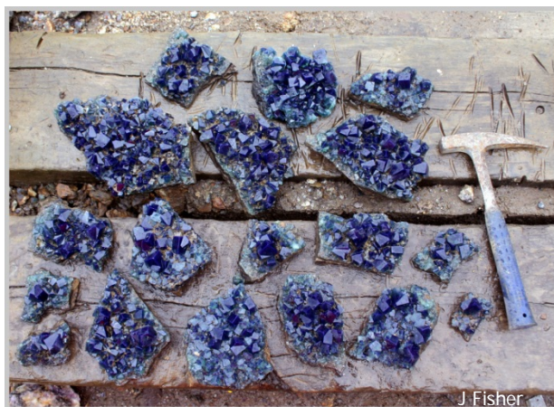
A good day's take at the Rogerley Mine.