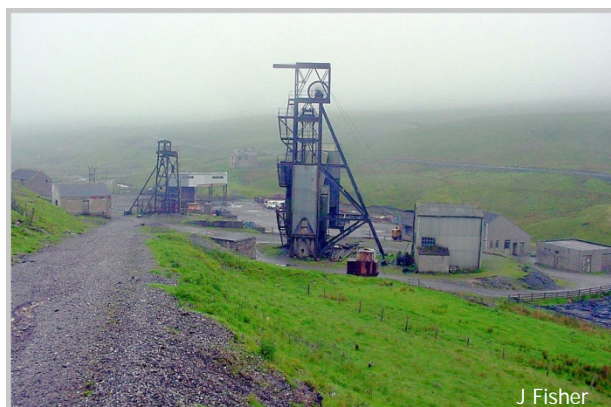
Groverake Mine in Weardale, which was the last operating commercial fluorspar mine in the region.